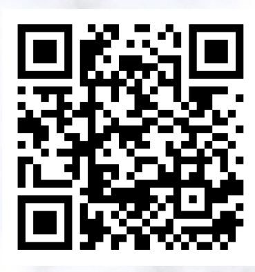
Scan QR Code to register